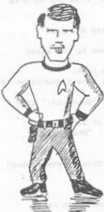
MR. SULU DCS